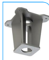
In Top Mount